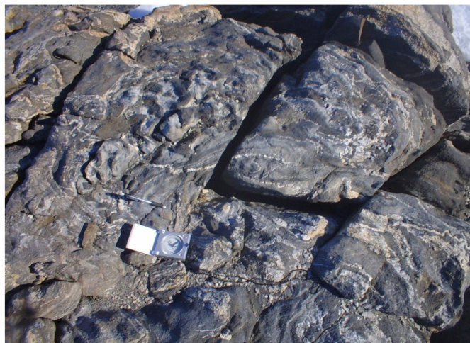
Amphibolite, Robertson Member.