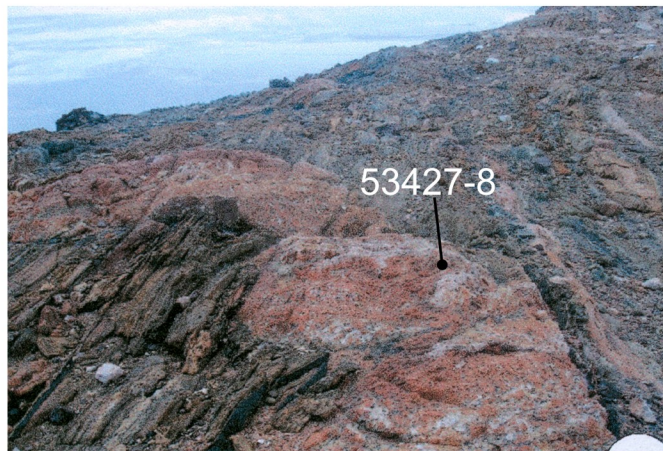
Sample 53427-8, young leucosome (6) in migmatite (a), Sidney Island.