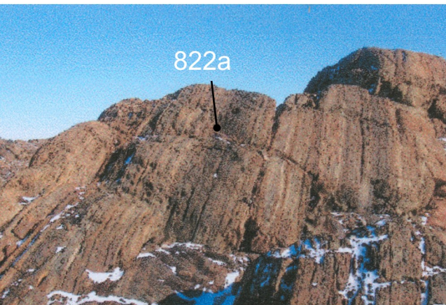
Sample 822a, Opx tonalite-gneiss intercalated with mafic granulite